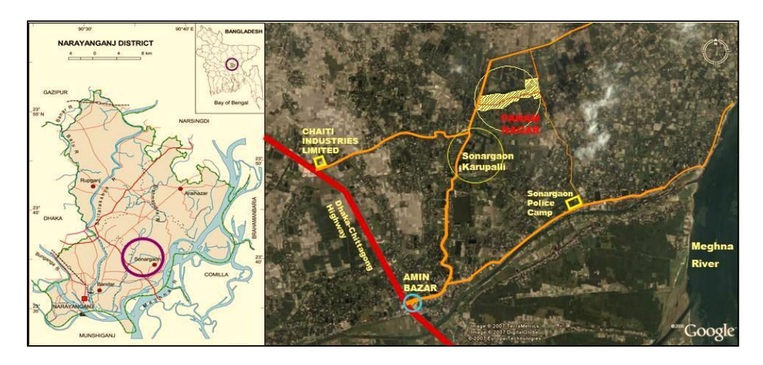
Figure 1: Map of Narayanganj District and Access Road to Panam Nagar, Sonargaon