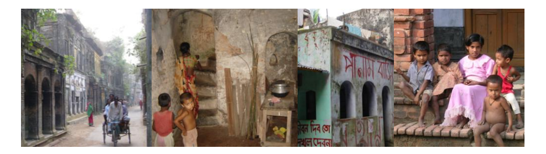
Figure 2: Survivals are in 'Panam Nagar'